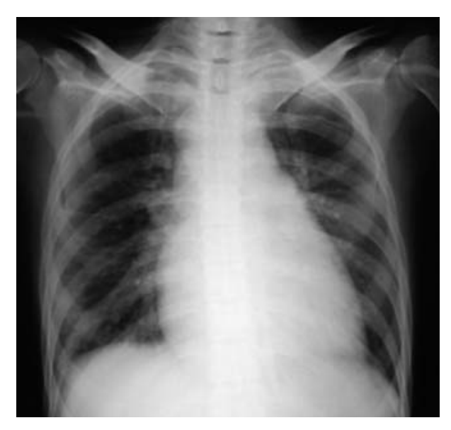
Fig. 1 Chest radiograph showing purse string-like cardiac appearance

renal failure.<sup>4)</sup> She also had no symptoms of SLE prior to admission, such as photosensitivity, arthritis, skin rash and neuropathy. Her height was 162 cm, weight 48 kg, blood pressure 80/60 mmHg, pulse rate 122 beats/min, body temperature 37.2 °C, and her thyroid gland was not palpable. No edema was found in the arms and legs.