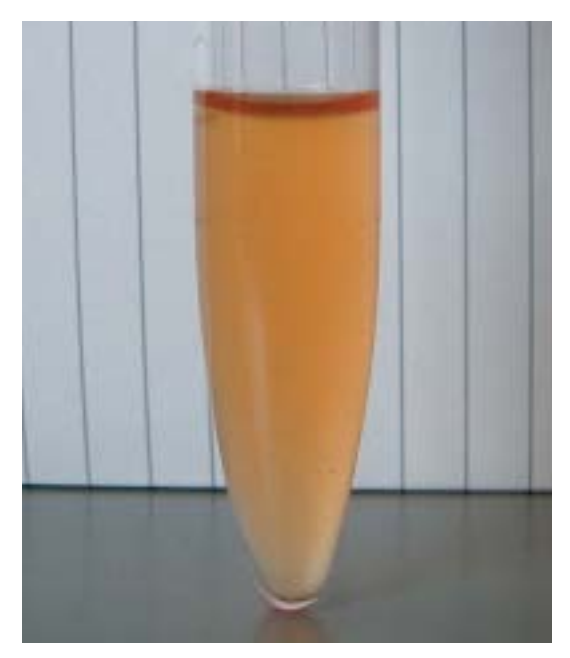
Fig. 3 Photograph of the product of pericardiocentesis

Puriform deposit was observed at the bottom of the yellowish fluid. Neutrophil dominant white blood cell increase seemed to indicate bacterial infection.